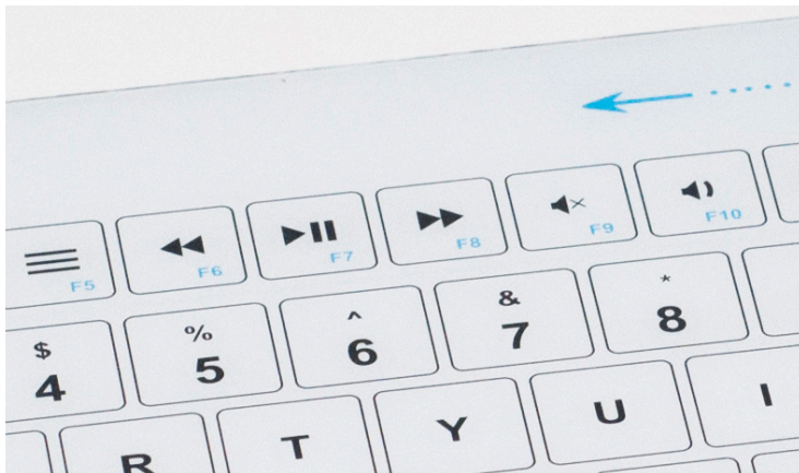
Full Video Playback Controls